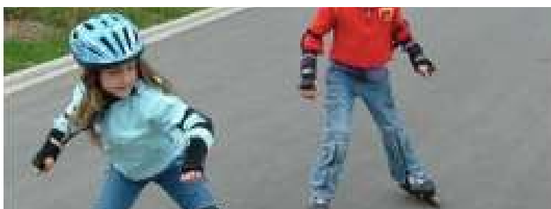
'Carfree' Residential Streets in Vauban

Germany's efforts highlight the importance of blending grassroots activism with practical solutions. Whether it's transforming cities through community-driven events or challenging industries with direct action, young people in Germany are proving that sustainability and climate justice are achievable goals for everyone.